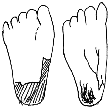
Figure 1: Target area for needling for blood draws in infants on the plantar surface of the foot (shaded area in drawing on left) and related vascularization (drawing on right).

I could have tried to release the client's right hamstrings in a direct intervention, but I judged that it would have only a temporary effect. As the nail injury seemed to be the causal restriction, my assessment was that the left foot needed more support. I thus decided to use a 'yielding' approach, also incorporating 'ma'. (I will discuss this